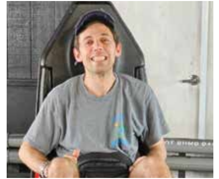
Dren is all smiles at the bumper cars