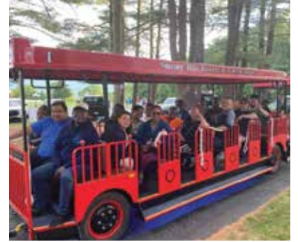
The group taking a train tour around the Sunny Hill resort campus with all smiles aboard.

Even though it was in the low 60 degrees, everyone was still daring enough to enjoy the outdoor pool.