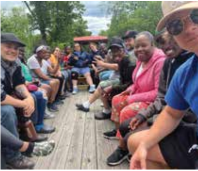
An afternoon tractor ride on the way to an outdoor barbeque lunch at Sunny Hill resort.