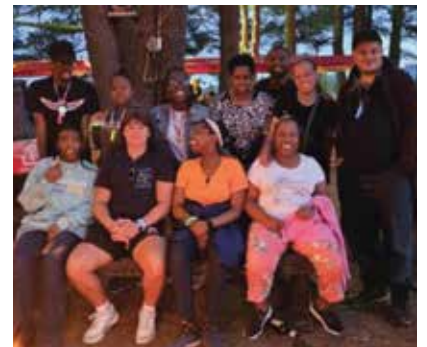
An after dinner campfire staying nice and warm on a chilly night with live background music on the lake at Sunny Hill Resort.

Sharing a magical moment with the medals that they just won at the basketball courts at Sunny Hill Resort.