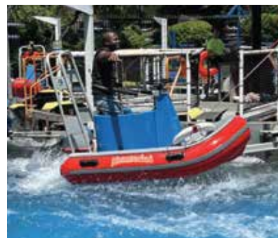
Jason Wet and Wild! at Adventureland