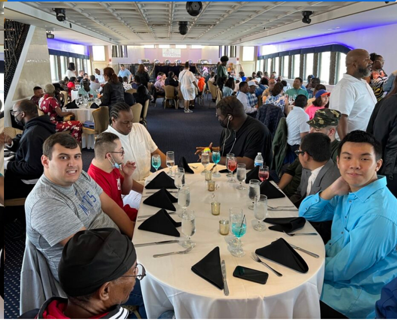
Figure 8 Dancing at CANY Cruise