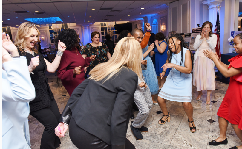
Figure 1 Dancing at the CANY Gala

Once again, our annual gala was a success. Honoring the outstanding individuals who made City Access New York possible was a pleasure. Music, dancing, and a cocktail reception kicked off the evening! The event ended with a live and silent auction. Remembering what brought everyone together on this particular day is always important. Everything is rendered possible by our exceptional participants. We value all staff and committee members' efforts to promote participant maximum independence and raise much needed funds for our programs that support the developmentally disabled and visually impaired. Most importantly, improving participant quality of life.