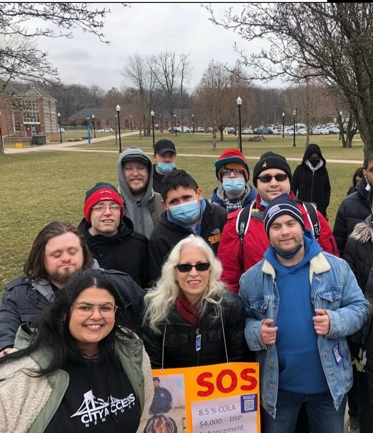
Figure 10 Protesting for the Cost-of-Living Adjustment for the non profit I/DD sector.

Another victory for City Access New York involving a cost-of-living adjustment for the non-profit I/DD service sector. However, this is just the beginning of changing the system of the service sector. With chronic underfunding and neglect by the state, hearing all the stories, struggles, and dreams of disabled activists shows how much needs to change. Be an advocate and voice for the community for those who cannot speak up for themselves. Thank you to the DSPs for putting their heart into this job and being able to support our individuals' independence; sometimes, amid everything going on in the world, it's touching to see those who care about equity, equality, and humanity as a whole. Let's keep it up!