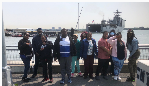
Figure 2 Brooklyn Day Hab at Fleet Week

Our participants had a great time at fleet week! This event allows NY citizens of all boroughs to meet and honor our Coastguard, Marines, and Sailors. Interestingly the first annual event was held in 1998 and coincides with Memorial Day. Not only is this event for the citizens, but this gives the marines, coastguards, and sailors a chance to experience the Big Apple.