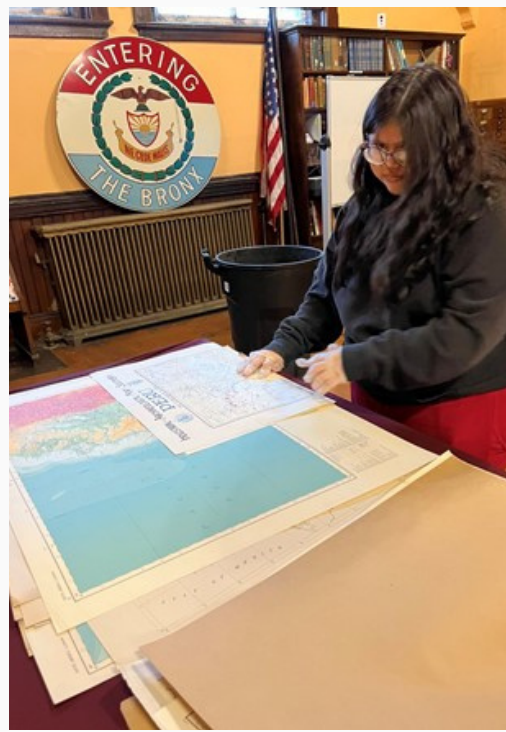
Figure 5 Gypsy interning at Huntington Free library